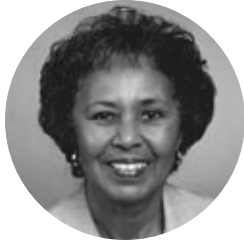
Yvonne Brathwaite Burke Supervisor, Second District