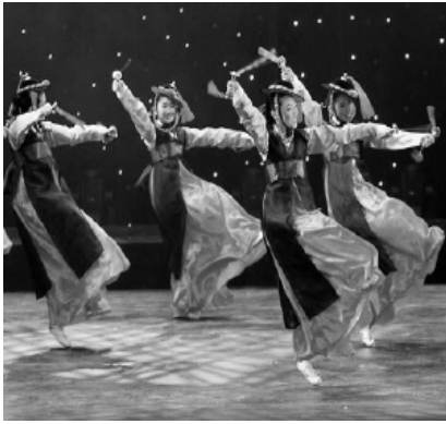
JUNG IM LEE KOREAN DANCE ACADEMY