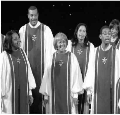
JUBILANT VOICES OF HOLMAN UNITED METHODIST CHURCH