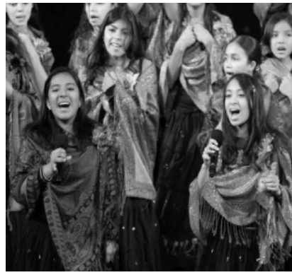
HARMONIES GIRLS CHOIR