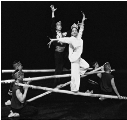
KULTURA PHILIPPINE FOLK ARTS