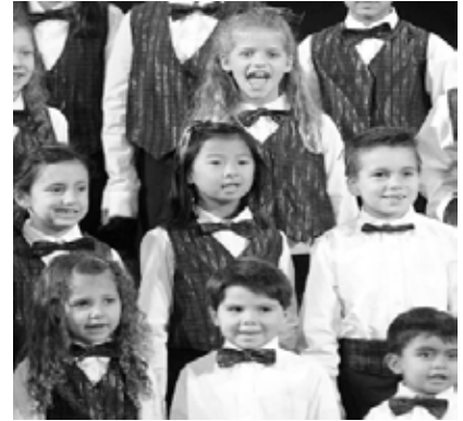
SALVATION ARMY TABERNACLE CHILDREN'S CHORUS