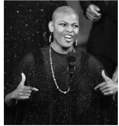
Albert McNeil Jubilee Singers