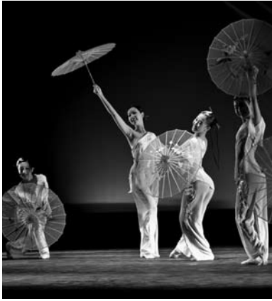
Dream Dance 2