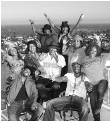
Inspirational Voices of Free!