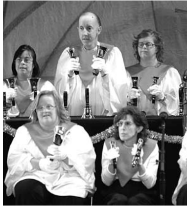
ARC Handbell Choir