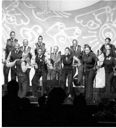
Mt. Rubidoux Seventh Day Adventist Church Choir