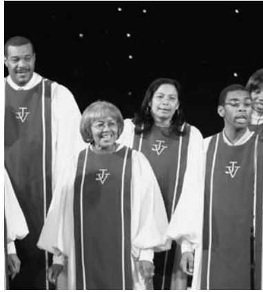
Jubilant Voices of Holman United Methodist Church