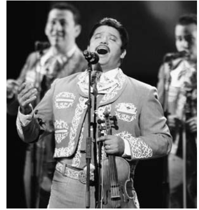
Mariachi Sol de Mexico de Jose Hernandez